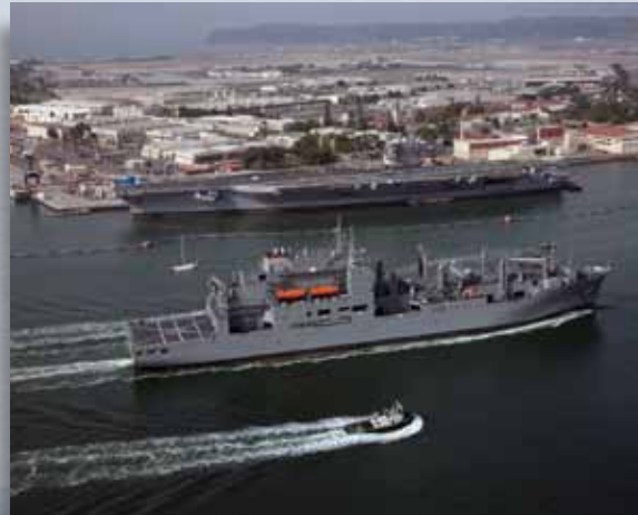
August 2011: USNS William McLean (T-AKE 12) passes USS Carl Vinson (CVN 70) in San Diego Bay during Sea Trials.