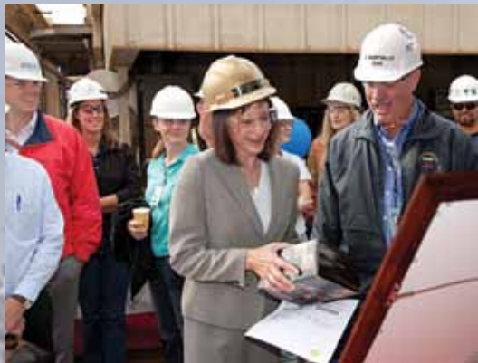
Start of Construction October 21, 2010

Mission: To deliver ammunition, provisions, stores, spare parts, potable water and petroleum products to strike groups and other naval forces, by serving as a shuttle ship or station ship.