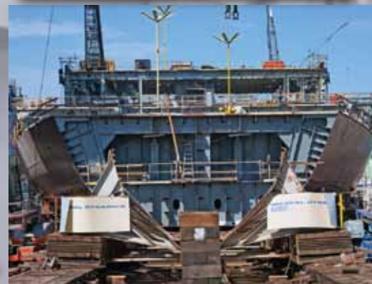
Construction August 2, 2011