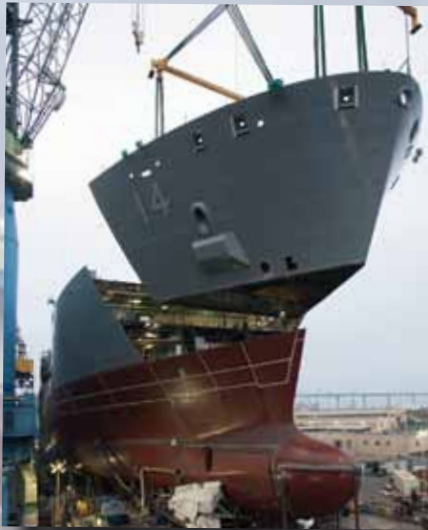
Bow Lift October 24, 2011