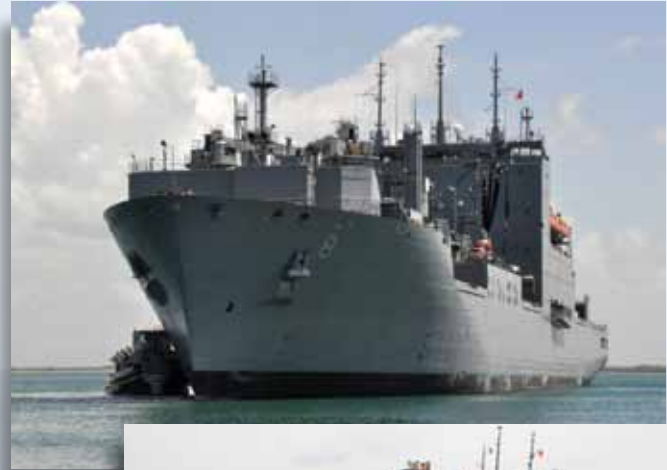
June 2010: USNS Wally Schirra (T-AKE 8) pulls into port at Naval Station Guantanamo Bay, Cuba to offload approximately 160 pallets of bottled water and dry food stores as part of Project Handclasp .