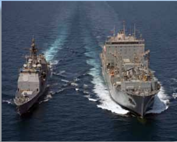
April 2012: USS Cape St. George (CG 71) pulls alongside USNS Charles Drew (T-AKE 10) for replenishment at sea in the Arabian Sea.