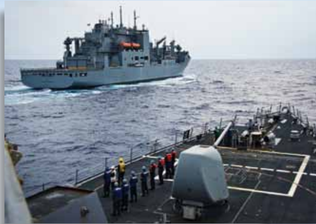
Nov. 2011: USS O'Kane (DDG 77) prepares for an underway replenishment with USNS Washington Chambers (T-AKE 11) during the integrated maritime exercise Koa Kai .