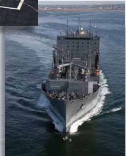
March 2012: USNS Medgar Evers completes Sea Trials.