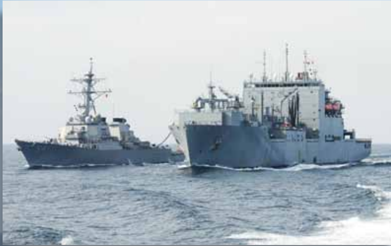
March 2011: USNS Carl Brashear (T-AKE 7) pulls alongside USS Curtis Wilbur (DDG 54) in the Pacific Ocean during a replenishment at sea with humanitarian aid supplies for delivery to Sendai, Japan, for tsunami relief in support of Operation Tomodachi .