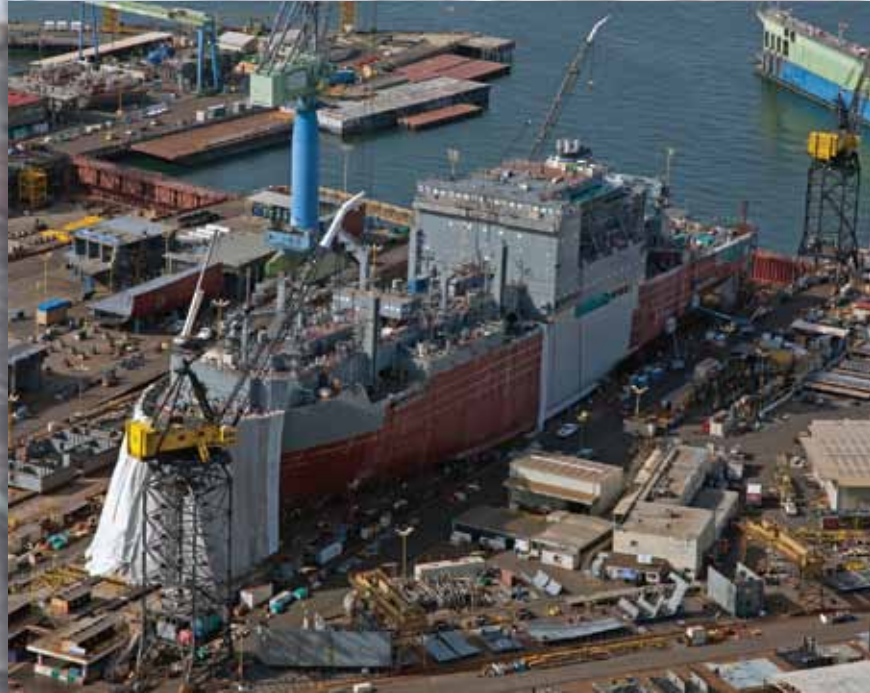
Construction March 28, 2012