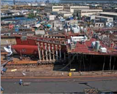
Construction August 4, 2011