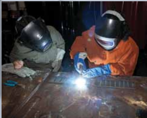
Keel Laid May 10, 2011